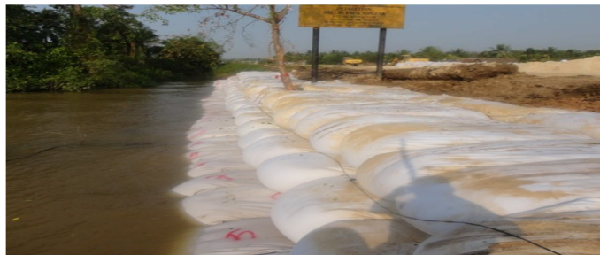
Figure 4: Example of geobag structure in other project site in Indonesia.