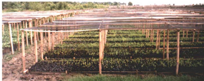
Figure 3: Seedling mangrove nursery area for mangrove trees.