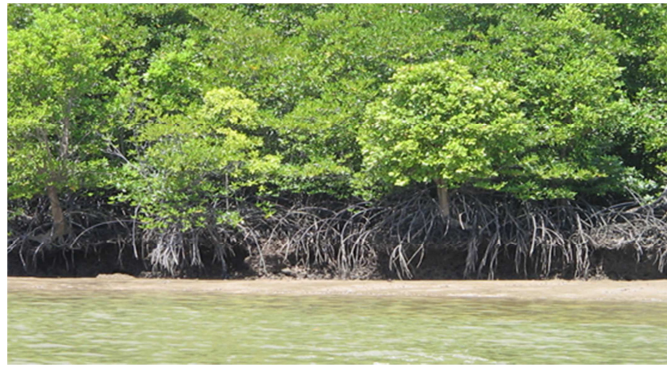
Figure 2: Illustration of Rhizophora type of mangrove trees.